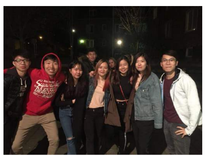
Club @ VG nation