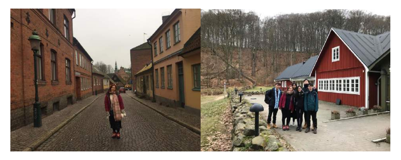
First photo in Lund

On 8/1 night, I arrived Copenhagen Airport with my exchange buddies and spent a night sleeping in the airport. On 9/1 which is the arrival day, people from Lund University came to take us to take the train to Lund and drive us to LTH Building to complete the arrival day procedure. After that, we went to our accommodations to unpack our luggage. We explore Lund C on the next day and the weather here is cold, and I need to wear the wind-proof jacket all the time. In the first month of exchange, we mainly spent our time to explore Lund and attended the Swedish Introductory courses. We joined VG nation and went to the welcome party there. We met a friend from Paris and became close and we went to Copenhagen for a two days' trip. The courses started at the end of January.