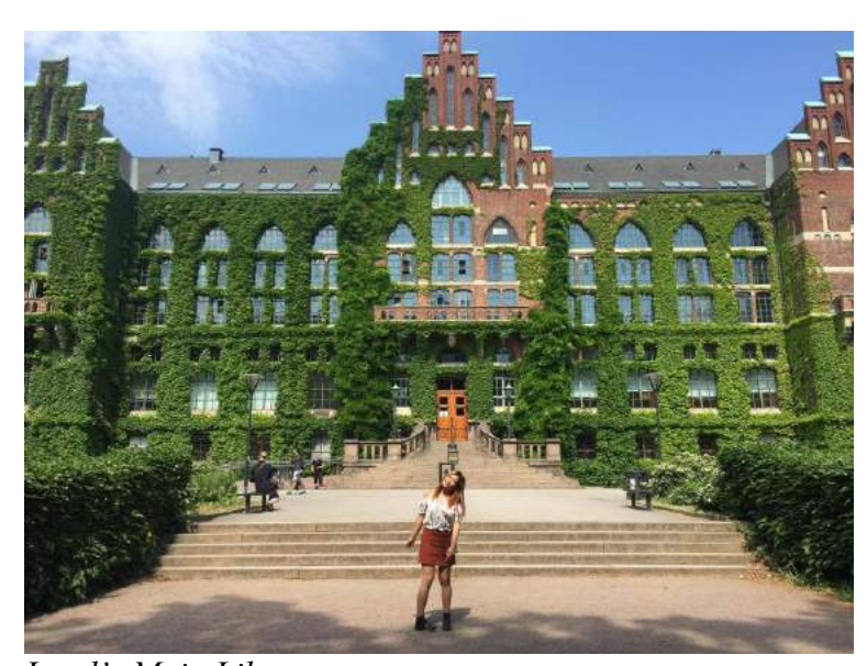
Lund's Main Library

It was the last month I stay in Lund, so I went to a Lund one day trip to explore Lund and it looked totally different compared to January (snow everywhere). We went to Main Building, Main Library, Church...everything sounds so familiar and I knew I will miss Lund so much as I never stay at a place outside Hong Kong for so long period. We ate a farewell dinner with the friends we meet from other countries. I went to Paris with my friends as our last trip and I went to Paris Disneyland which the firework show was so memorable. After the Paris trip, we backed to Lund and started packing and tidying up the room I lived for six months and took the flight back to Hong Kong From Copenhagen – the place where I started my exchange journey.